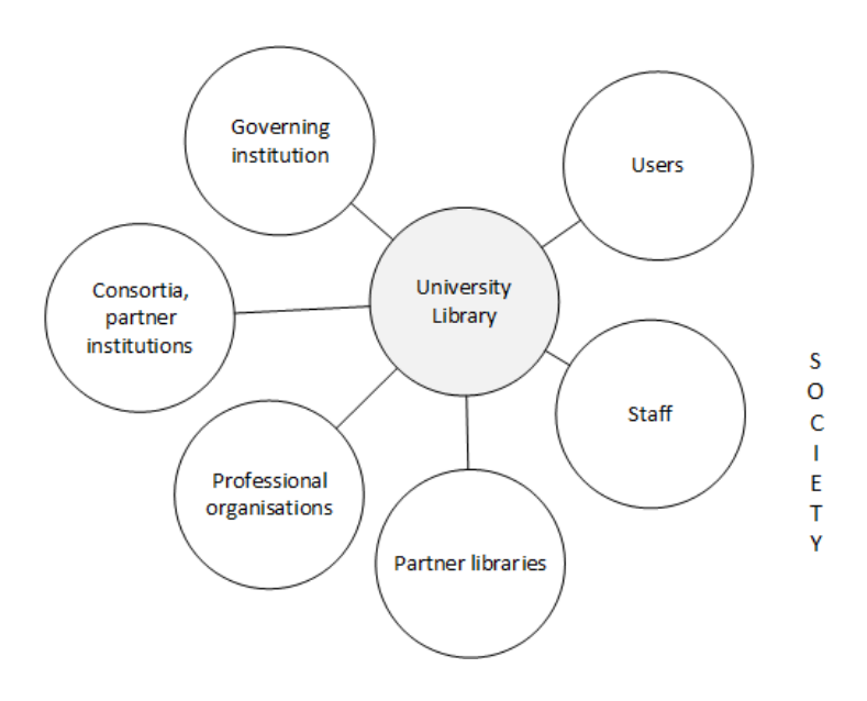
Figure 1: Stakeholders of a university library