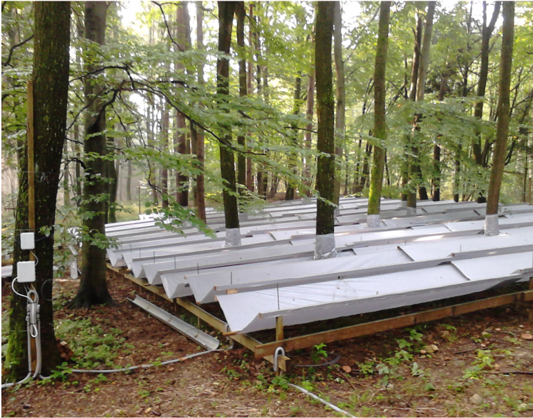
Figure 1. Modular roof system for drought simulation at the MAD Experiment site.